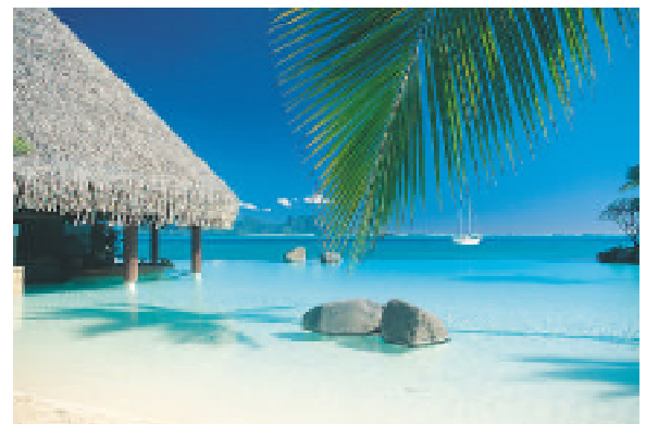
Tahiti Beachcomber Inter-Continental.

For a diverse, high quality Tahiti product at an exceptional value, travel agents may contact Pacific Escapes toll-free at 1-800-777-7992 or visit www.pacificescapes.com